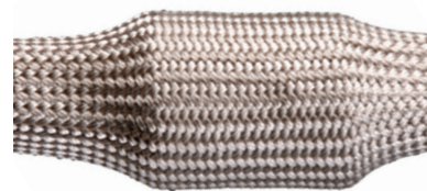
Insultherm® Ultra Flex® Pro expands up to 50% for easy installation

The heavy wall construction, large available diameters, and high expandability of ULTRA FLEX® PRO (FHH) provides a high level of protection and ease of installation when used to insulate pipes and hoses subject to abrasion and vibration. Ultra Flex® Pro cuts easily with scissors, and special heat treated construction minimizes fraying and dusting during assembly. Increased wall thickness adds value to insulation.