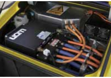
Tomorrow's electric vehicles are more compact with higher power. Flex Glass FR is design to control up to 7,000 volts in tight spaces safely and efficiently.

SF sleeving is rated to 392°F. (Class H), is abrasion resistant, and maintains it's flexibility in low temperature environments. It is available in a very wide range of sizes, and is ideal for use in appliance assemblies, wire harnesses, transformer leads, power supplies, motor coil and heater leads.