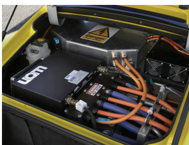
Tomorrow's electric vehicles are more compact with higher power. Flex Glass FR is designed to control up to 7,000 volts in tight spaces safely and efficiently.

SF sleeving is rated to 392°F. (Class H), is abrasion resistant, and maintains its flexibility in low temperature environments. SF is available in a very wide range of sizes, and is ideal for use in appliance assemblies, wire harnesses, transformer leads, power supplies, motor coil, and heater leads.