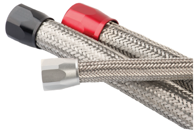
Stainless Steel XC gives full coverage on any application and slides onto hoses for that cus-