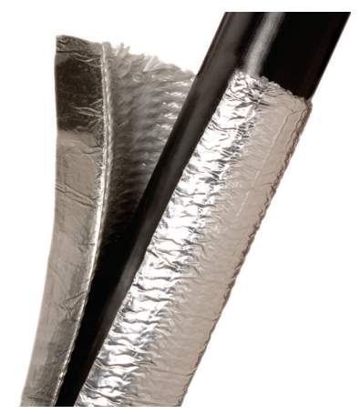
T6® is shipped in pre-cut 4' lengths

T6® can reduce the heat transmission from hot pipes or engine components into hoses or harnesses by up to 50% or more.