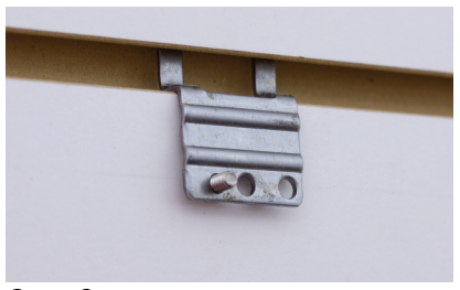
Step 3 Mount rack aligning screws.