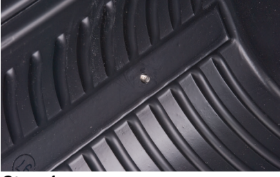
Step 4 Install nuts.