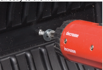
You can also add anchors for extra support.

Screw your display rack directly to the wall.