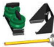
INN-EXPCL Flexo Sleeving Rapid Install Tool - Single Kit, Small