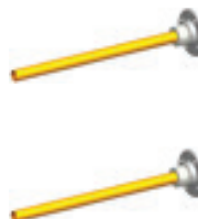
INN-EXPT063 Flexo Sleeving Rapid Install Tool - 3 ft. Tube Assembly