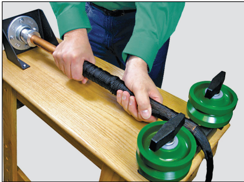
Step 1 Load sleeving over the tube.