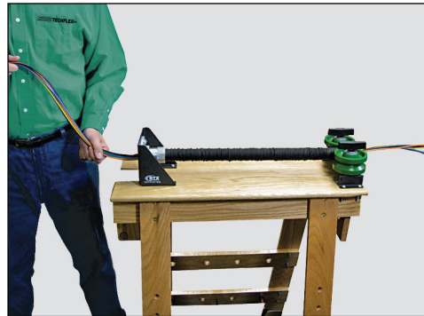
Step 2 Push wire bundle through the machine until it appears out of the tube.