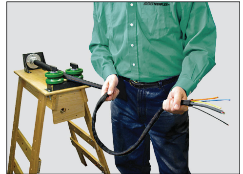
Step 3 Pull both sleeving and wire bundle to desired length.