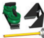
INN-EXPSL Flexo Sleeving Rapid Install Tool - Single Kit, No Stand