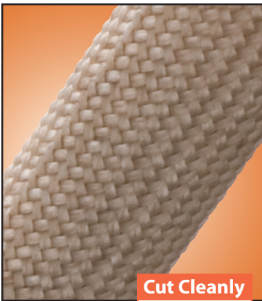
Cut Cleanly Scissors