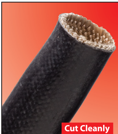
Cut Cleanly Scissors

SG has a high tear strength, slight expandability for easy installation, excellent flex life and resistance to fatigue. It is Class H rated (392°F) with an operating temperature range of -103°F to 428°F. SG shows no discernible effects under exposure of up to 10 megarads of radiation.